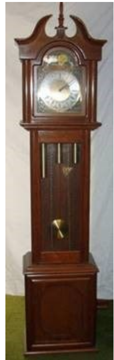
Daneker Clock manufactured in Fallston

(You will need to wait for the book to find out the rest of the story.)