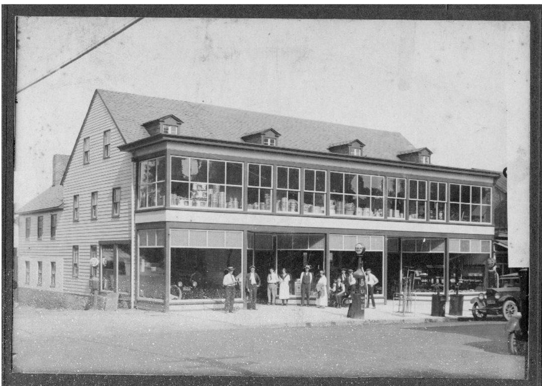
Courtland Hardware, 1958

We look forward to receiving your ideas and plans.