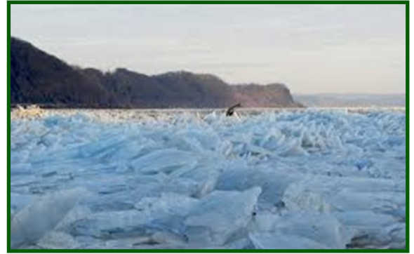
Ice Jam on the Susquehanna