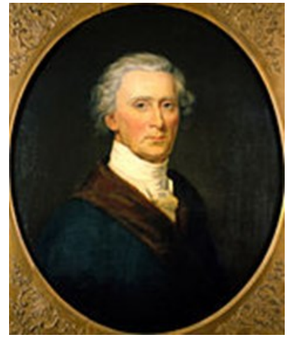
Portrait of answer to Question 4