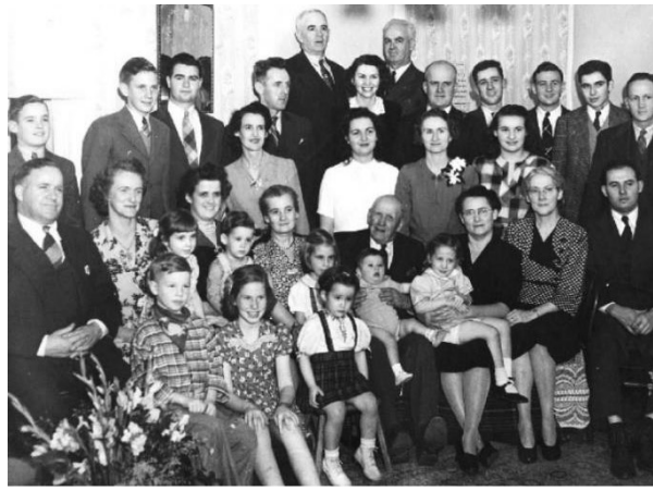
Grandpa and his family on his 83rd birthday, January 28, 1947