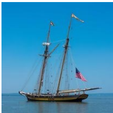
Pride of Baltimore II

The Harford 250 Summer of Fun began with the June 2-5 visit from the Pride of Baltimore to Havre de Grace. The Maryland Dove , followed on June 24-25. Thousands of visitors admired the ships and learned about their role in history. HarfordTV has posted a fabulous video is posted on their Facebook page.