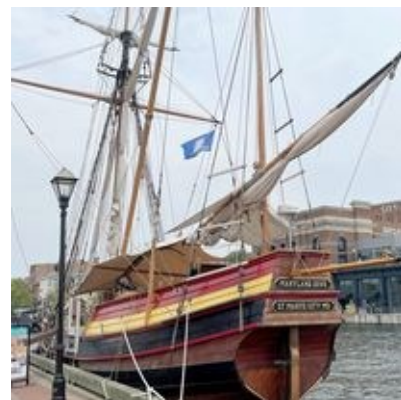
The Maryland Dove

The Harford 250 Summer of Fun began with the June 2-5 visit from the Pride of Baltimore to Havre de Grace. The Maryland Dove , followed on June 24-25. Thousands of visitors admired the ships and learned about their role in history. HarfordTV has posted a fabulous video is posted on their Facebook page.