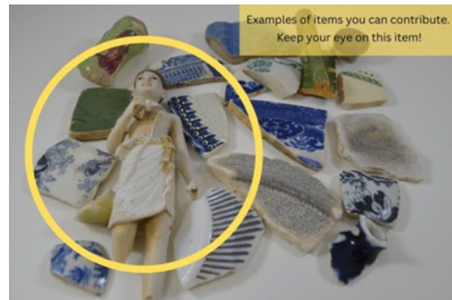
Samples of donated pieces used in previous mosaic projects